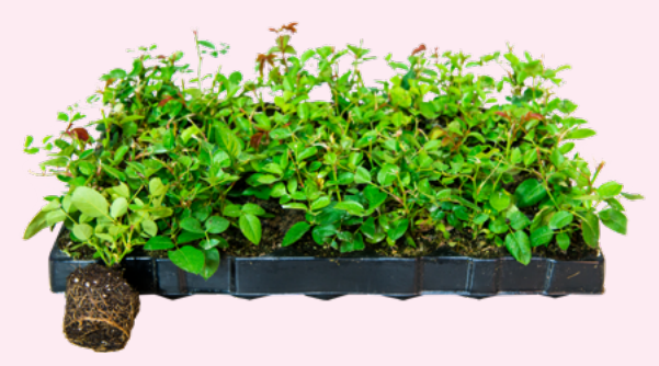
28-plug propagation tray