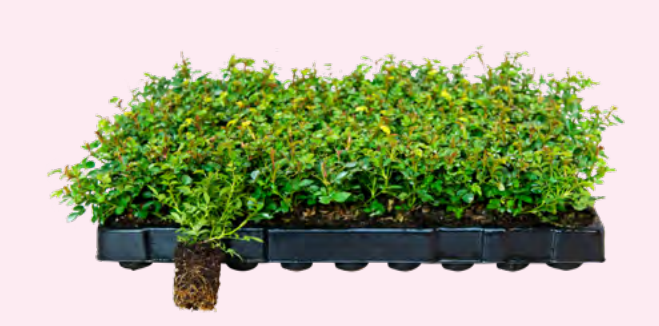
51-plug propagation tray