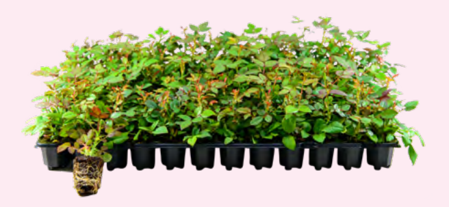
84-plug propagation tray