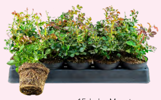
15-holes Mara tray