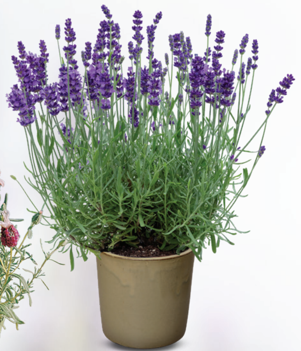
Lavandula angustifolia BeeZee™ 'Dark Blue' P

Hishtil's organic lavender assortment - which includes two species, angustifolia and stoechas - was developed over ten years and includes cultivars especially suited to organic cultivation, with high performance and plenty of flowers that will attract and keep the bees busy during the long flowering seasons.