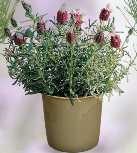
Lavandula stoechas 'Kew Red'