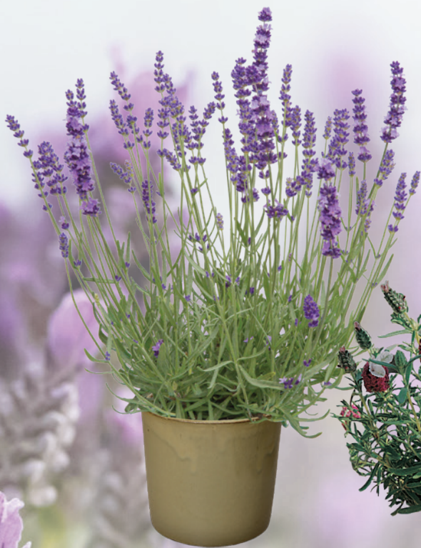
Lavandula angustifolia 'Forever Blue' P