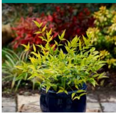
Nandina domestica Brightlight ('Selten004') PBR