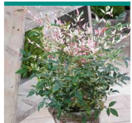
Nandina domestica 'Twilight' PBR