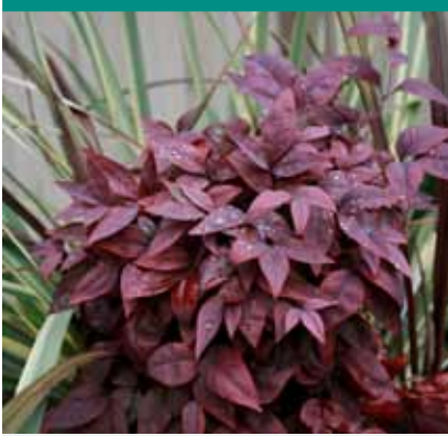
Nandina domestica Blush Pink ('Aka') PBR