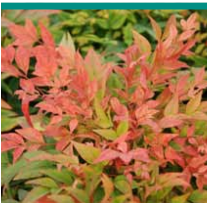
Nandina domestica 'Gulfstream'