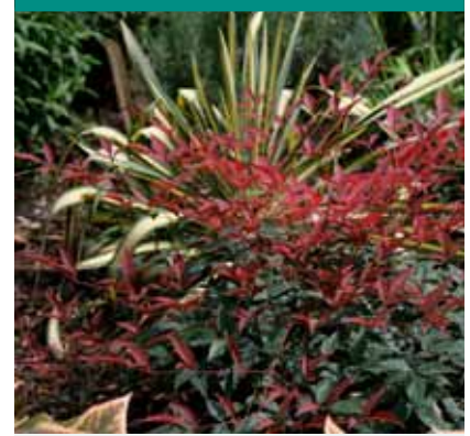
Nandina domestica Flirt ('Murasaki') PBR