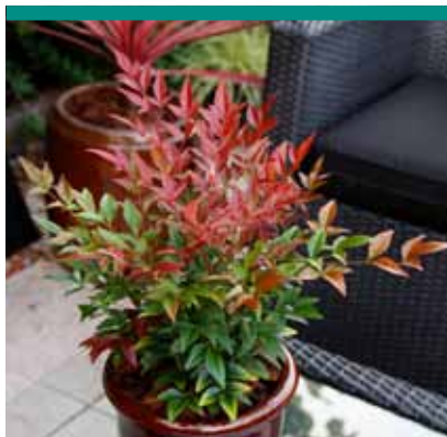
Nandina domestica Obsessed ('Seika') PBR