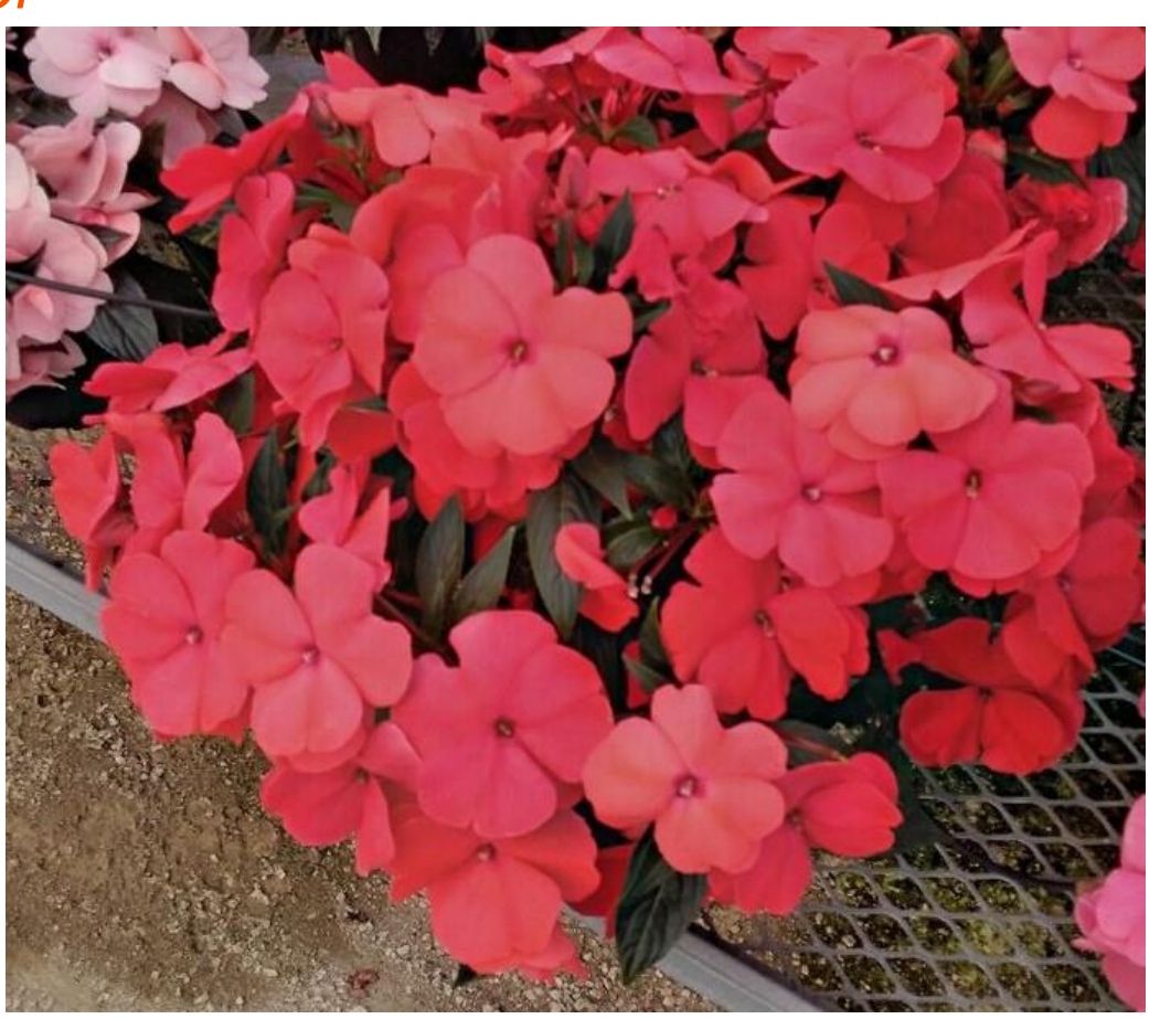
30461 Magnum XL Salmon