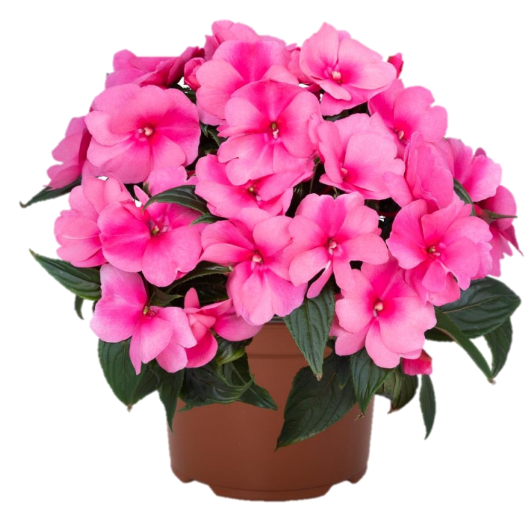
30444 Petticoat<sup>TM</sup> Pink Punch

• Has larger flowers and is a little more vigour