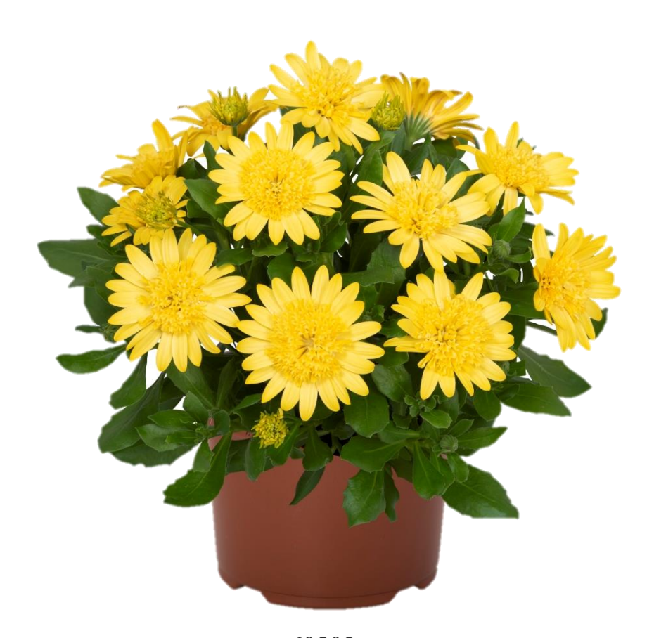
60302 Margarita Double Yellow 40