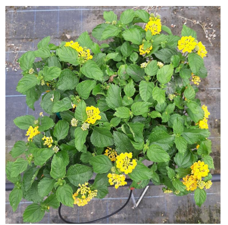
72169 Havana Gold 71