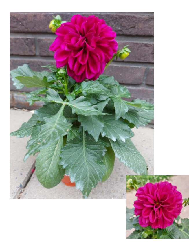
73999 Novation® Premium Purple 71