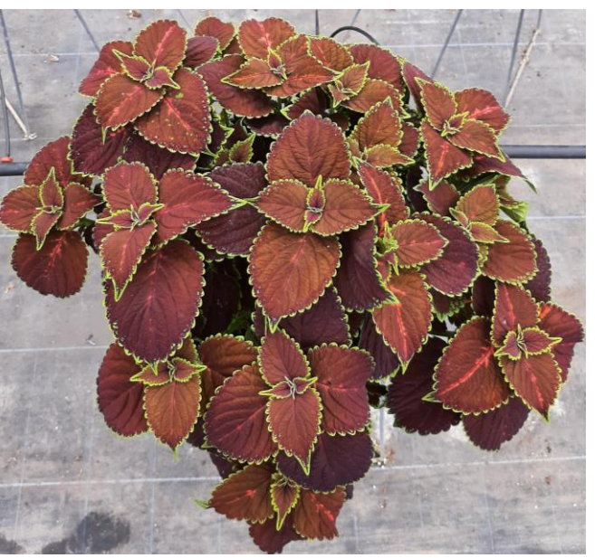
71049 Main Street Las Vegas Boulevard