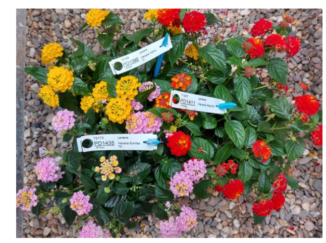
72169 Havana Gold 71 (TV2) 72173 Havana Rose 70 (TV2) 71987 Havana Red (C1)