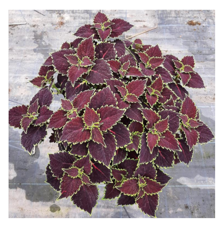
71046 Stained Glassworks Molten Lava