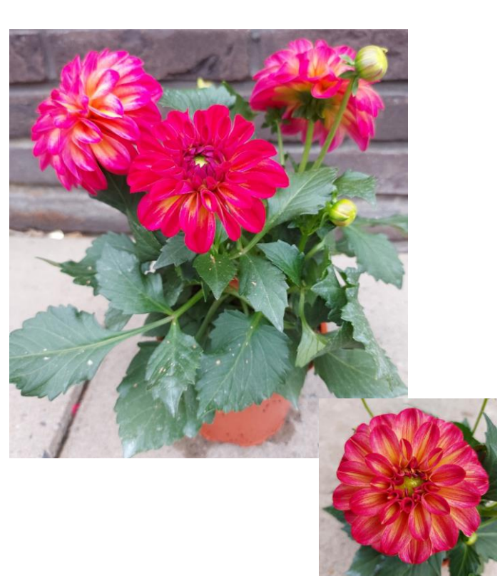
73998 Novation® Premium Bronze Bicolor 74