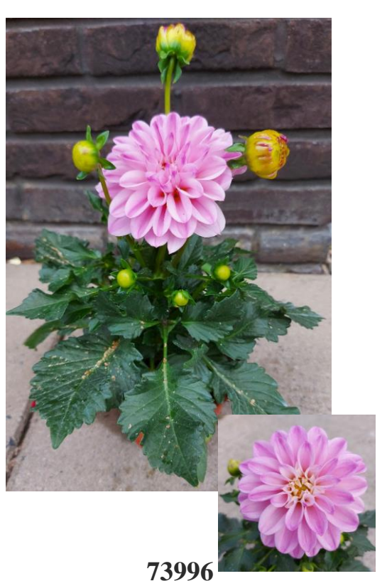
Novation® Premium Pink Bicolor 72